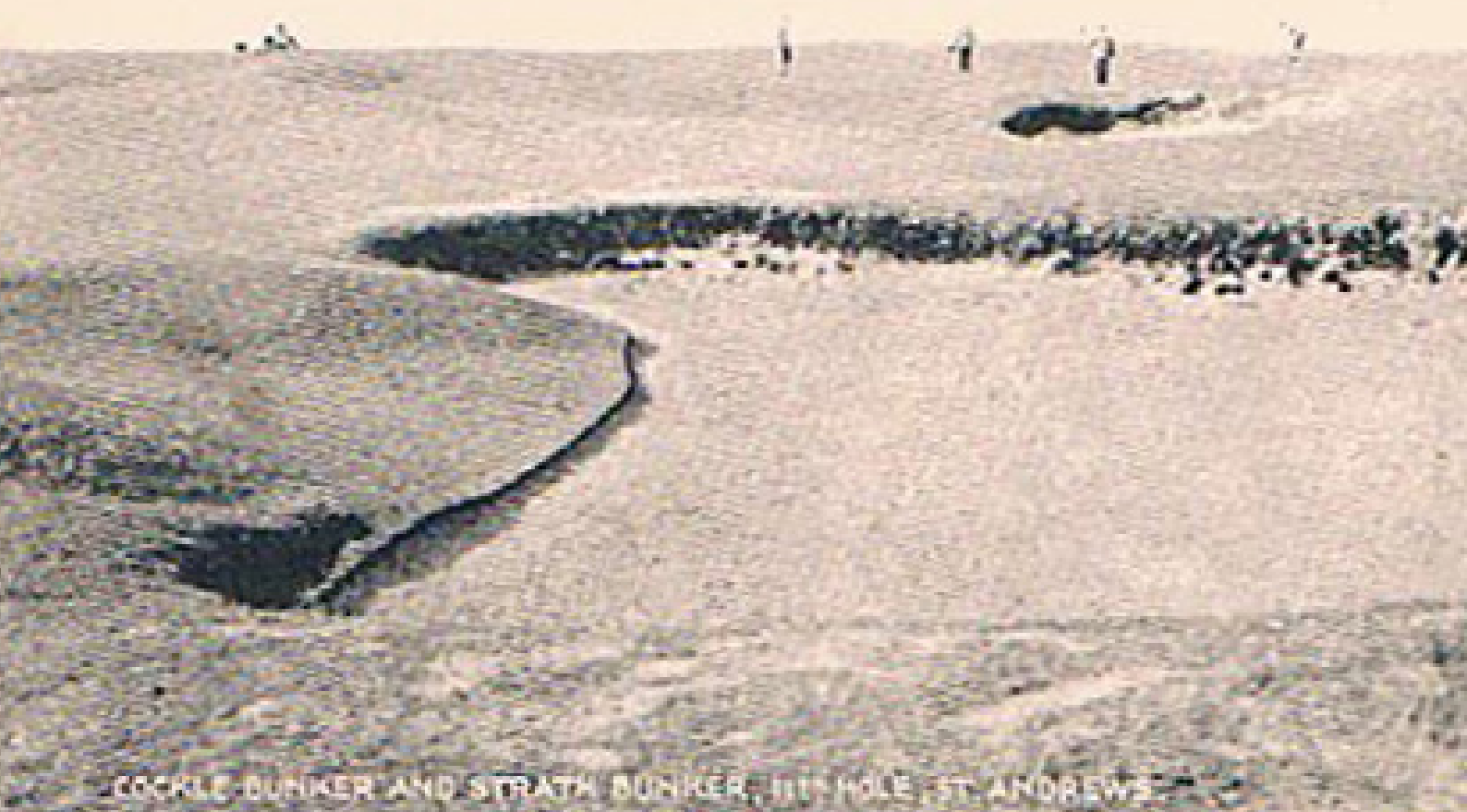
COCKLE BUNKER AND STRATH BUNKER, 11TH HOLE, ST ANDREWS

Doak went further; "I have felt for many years that The Old Course was sacred ground to golf architects, as it was to 'Old' Tom Morris, C.B Macdonald, Harry Colt, and Alister