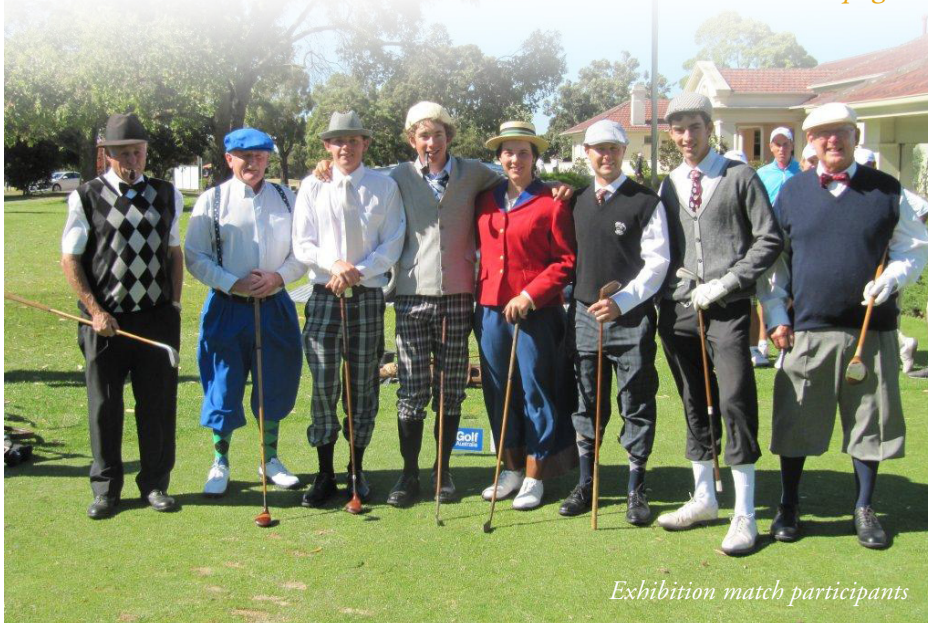
Exhibition match participants