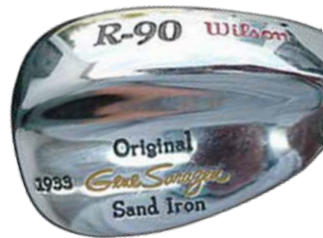
Sarazen's first sand iron

The wedge he designed had a weird concave face and resembled a large ice cream scoop on a stick, but it began to marketed under the Walter Hagen logo, and the pros of the day went for it.